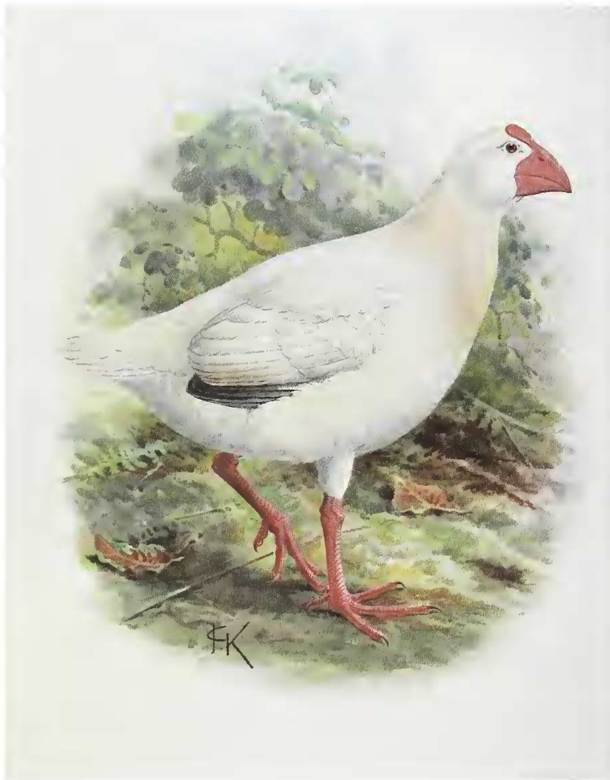
Figure 13. Illustration of a Takahe-like Lord Howe Gallinule Notornis alba in Rothschild (1907) by J. G. Keulemans, based on how Rothschild thought the species would have appeared in life; although it is based on the Vienna specimen, artistic license permitted Rothschild / Keulemans to erroneously picture the bird with coloured primaries

raperi in recognition of the artist. His grounds were extremely dubious to say the least and, subsequently, when Mathews (1936) had reproduced the Raper painting (Fig. 14) and compared it to the Vienna skin, he admitted his error and synonymised P. raperi under P. albus .